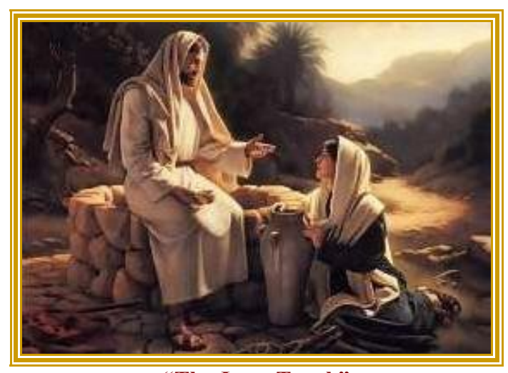
"The Jesus Touch"

A step-by-step program used in combination with CAA Ministries' Web Based Outreach-Link program.